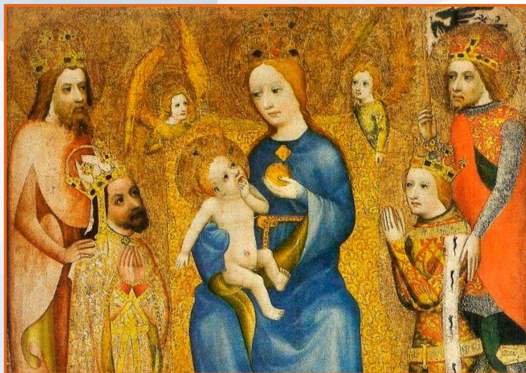
Votive picture of Archbishop Jan Očko from Vlašim. 14 th century, National Gallery, Prague